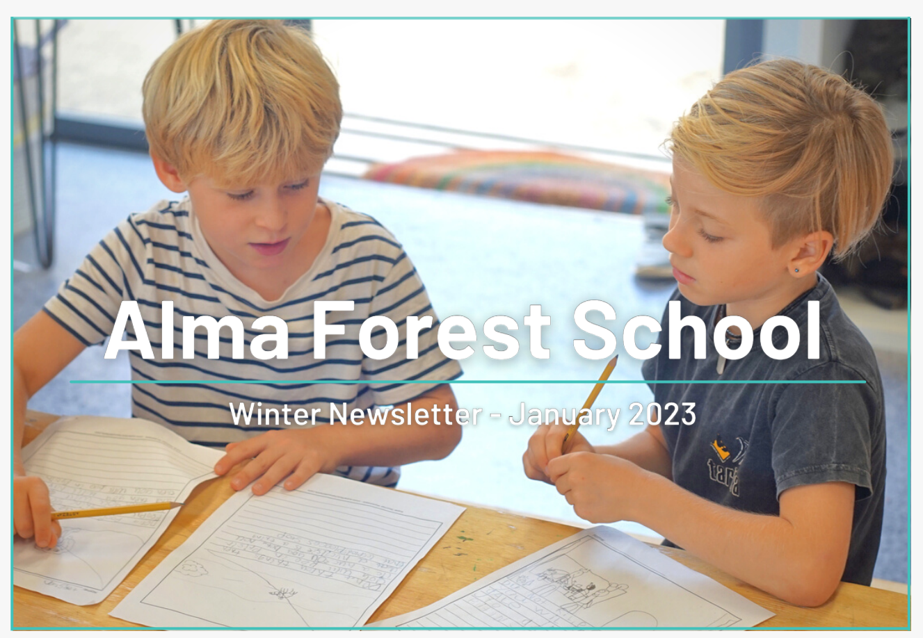
Students giving each other feedback during a writing workshop.