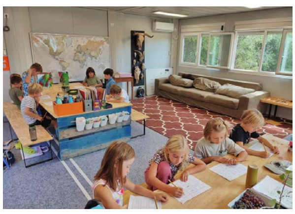
Planning and drafting a piece of writing.