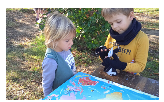
Escuela Bosque investigating connections between their home lives and other cultures around the world.

To find out more about what this looks like at Alma Forest, have a look at this Curriculum Outline.