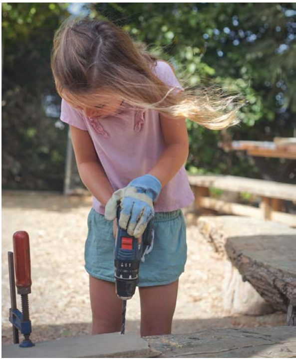
Working on a personal projects using real tools.