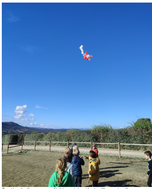
Testing balloons on a fishing string that will eventually carry a camera.

My personal project helium balloon test because it was something we don't usually do and it was something the Escuela Bosque saw as well. It looked a bit like an animal, a big ball with a little tail.