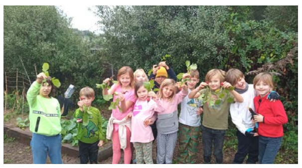
Celebrating the first radishes.

We recently added a large raised bed to the Primary School outdoor space and our students have been busy planting vegetables. We already had a scarecrow that a student made as a personal project and now it has some plants to protect. Unfortunately, the local slugs were not all that scared of it. Fortunately, they did not manage to stop our radishes from growing. Just before the winter holidays, we harvested the radishes and there were enough to go around.