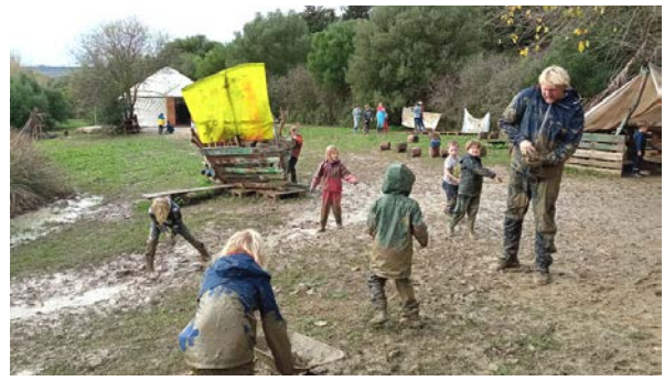
Celebrating the rain with a mud fight.