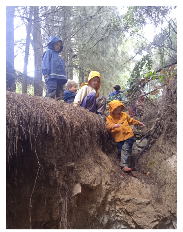
Exploring the ravine.