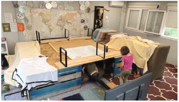
Turning the classroom into a giant fort.