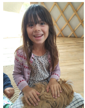
A guest cello and a visiting guinnepig.