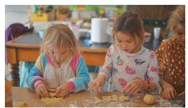
Pyjamas and cookies on the last day of school in 2022.